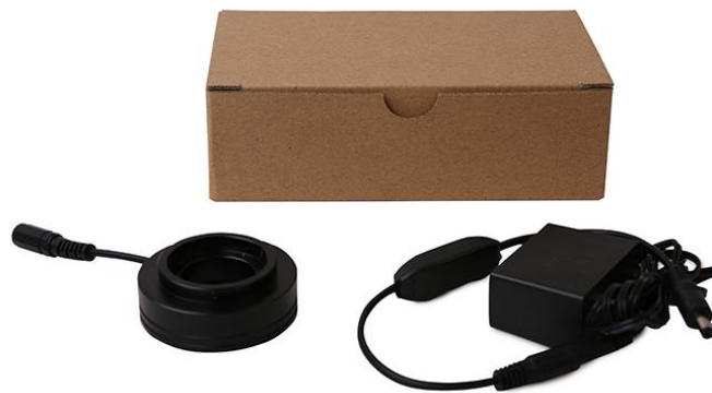
Figure 7 TZM0756DRL, including LED Direct Ring Light and Power Adapter

The packing information of TZM0756DRL is as follows: