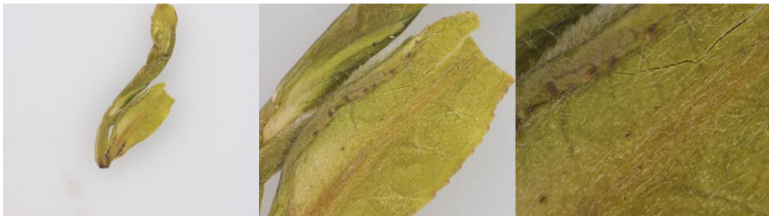
Figure 5 Pictures of Tea taken with TZM0325-W5100-TV5100 left) 0.3X, middle) 1.2X, right) 2.5X