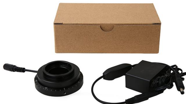
Figure 8 TZM0756DRPL, including LED Direct Ring Polarization Light and Power Adapter

The packing information of TZM0756DRPL is as follows: