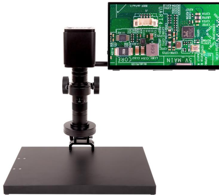
Figure 3 TZM0325-W4100- TV4100+TZM0756DRL-85+HDMI Camera+TPS-210A+SCRN