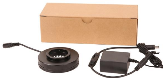
Figure 9 TZM0756DRL-85, including LED Direct Ring Light and Power Adapter