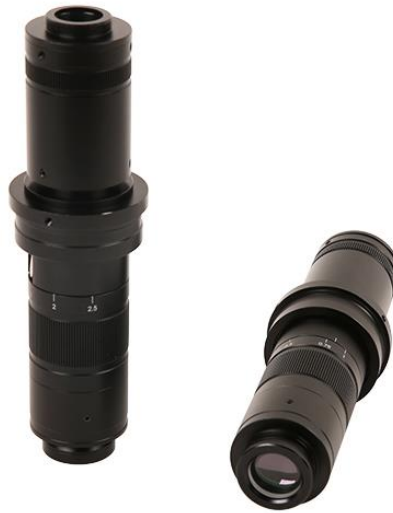
Figure 1 TZM0325 with different module

TZM0325 series MZO (Monocular Zoom Objective) is an ideal choice for machine vision, industrial inspection, scientific research and education. The design is based on the bilateral parallel light path principle and the modular design concept, with superior optical performance and strong compatibility.