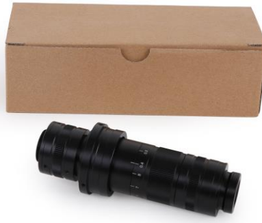
Figure 6 The TZM0325 Main Body, including Auxiliary Lens Module, Middle Zoom Module, TV Lens, Camera Adapter Tube and Bracket Adapter

The packing information of the TZM0325 series MZO is as follows: